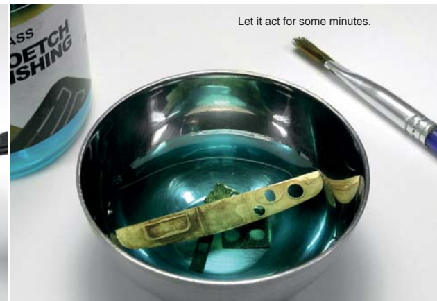
Let it act for some minutes.