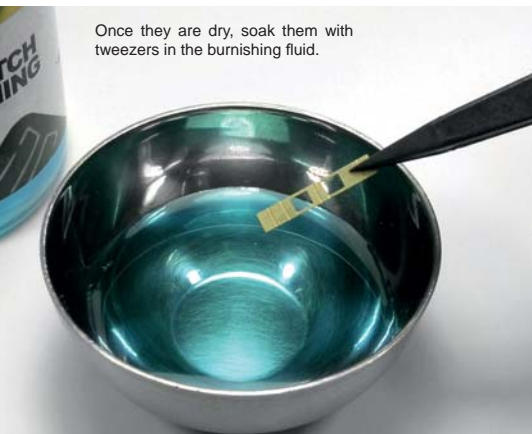
Once they are dry, soak them with tweezers in the burnishing fluid.