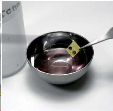
After preparing and separating all the parts with the help of tweezers dive them into the acetone.