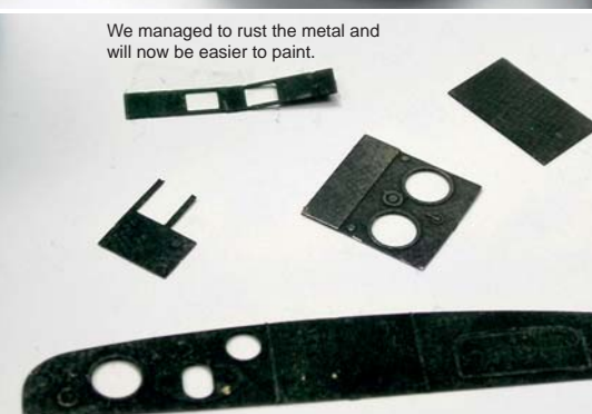
We managed to rust the metal and will now be easier to paint.