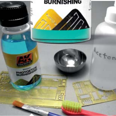
Materials needed for the process.