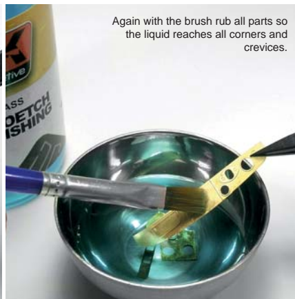
Again with the brush rub all parts so the liquid reaches all corners and crevices.