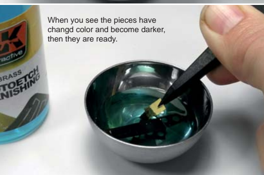
When you see the pieces have changed color and become darker, then they are ready.